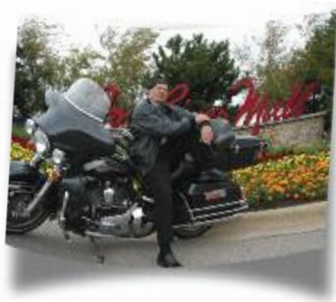
Many local dignitaries helped us convince the Wisconsin HOG Rally that the Fox Cities was a great place to ride.